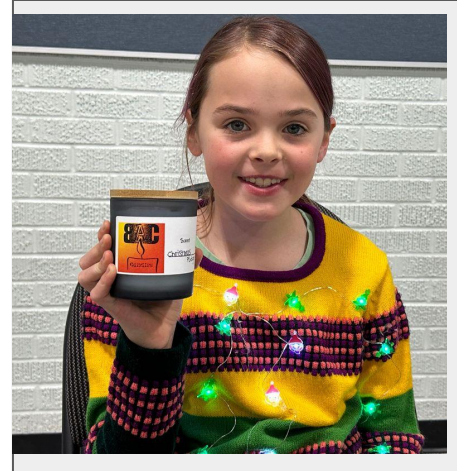
Above: A Grade 5 student sells a candle she created for the market.

Right: a strong community turn out to the Bowden Grandview Christmas market was a key part of the event's success.