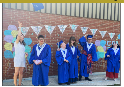
Graduation! There was much jubilation during the cap toss at Horizon School's graduation.