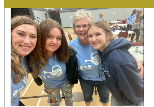
Growing great kids - Ecole Fox Run students enjoyed an interactive walk with seniors from their Sylvan community.