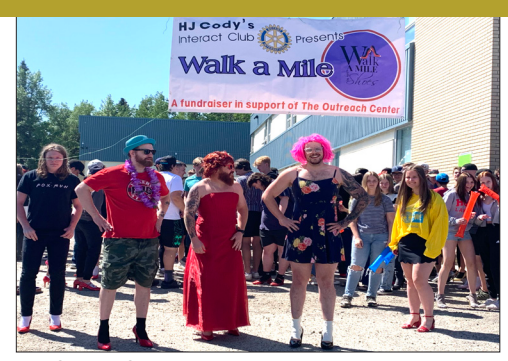
A force for good - Ecole H.J. Cody team raises awareness about sexual assault and gender violence at annual event.