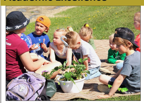
Learning to grow - Pre-K students from Spruce View School learned about plants at The Jungle Farm.